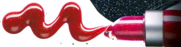
From below left, Custom Blend Lip Gloss in The Kay, £20, Prescriptives (0870 034 2566); Crushed Jewel Gel Liner in Onyx, £9.50, Jemma Kidd Make Up (available at Boots nationwide)

Q I've got small bumps on my upper arms and want to get rid of them for the LBD season. Help!