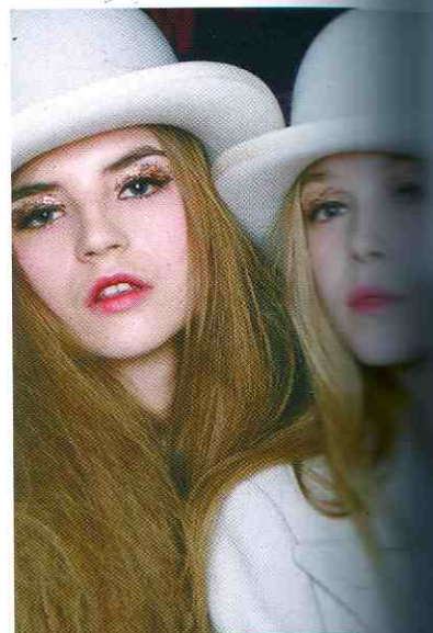
SONIA RYKIEL AUTUMN/WINTER