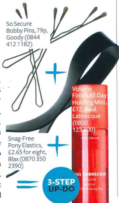
So Secure Bobby Pins, 79p, Goody (0844 412 1182)